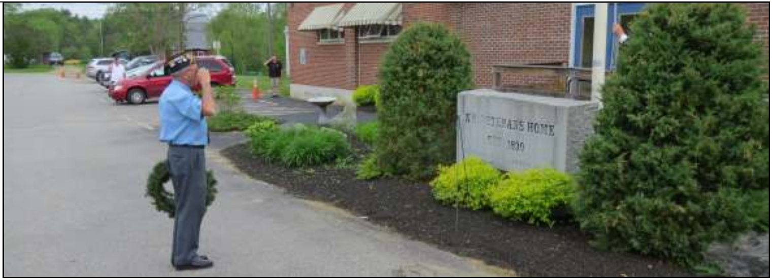
NHVVH Memorial Day 2014