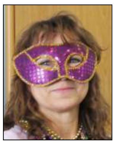
February 9, 2:30 p.m.: Mardi Gras

January 9, 2:30 p.m.: American Legion Auxiliary Post-Holiday Party with Sylvan Roots