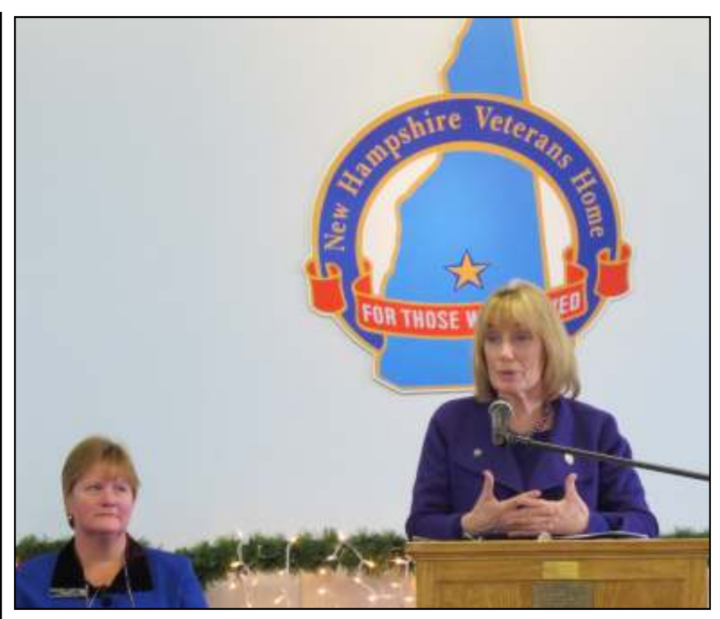
Gov. Maggie Hassan delivers keynote remarks during the New Hampshire Veterans Home's 125th Anniversary celebration on Dec. 3 in the Town Hall.