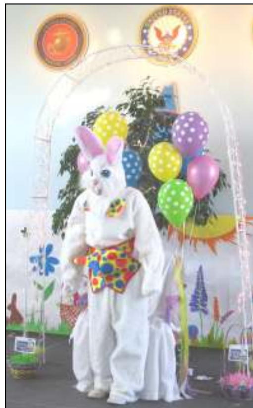
April 8 — Easter Egg Hunt – 1 p.m.