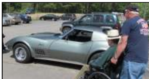
June 17 — Gate City Corvette Club Ice Cream Social, 2 p.m., Pavilion