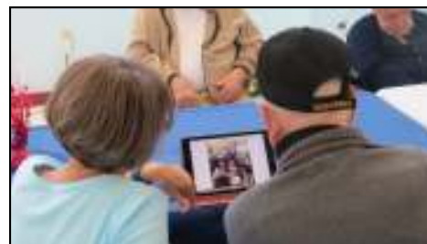
June 18 — Father's Day Dance, 2:30 p.m., Town Hall