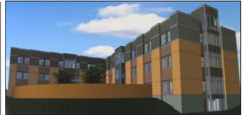
Architect's rendering of proposed LEDU third-floor addition.