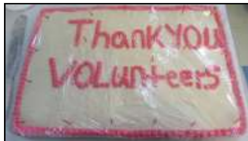
April 26 — Volunteer Appreciation Luncheon, 11:30 a.m., Town Hall