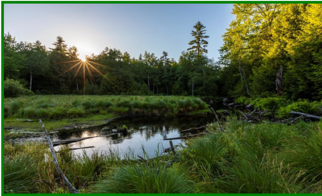
Leighton Forest, Barrington