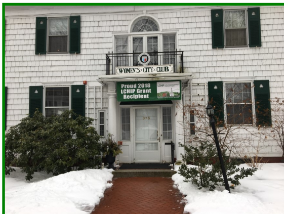
Portsmouth Women's City Club