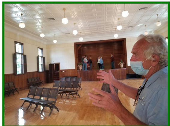
Grand Reopening, Whitcomb Hall, Swanzy