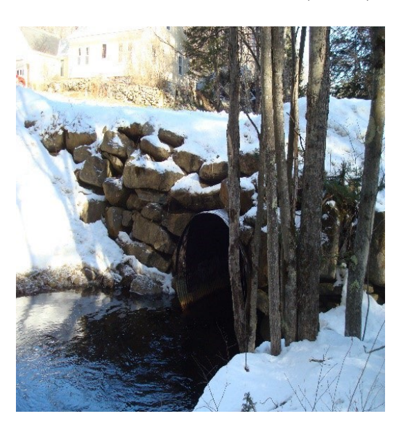
Baine Road culvert in Marlow (after)