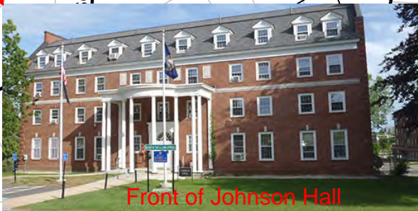
Front of Johnson Hall