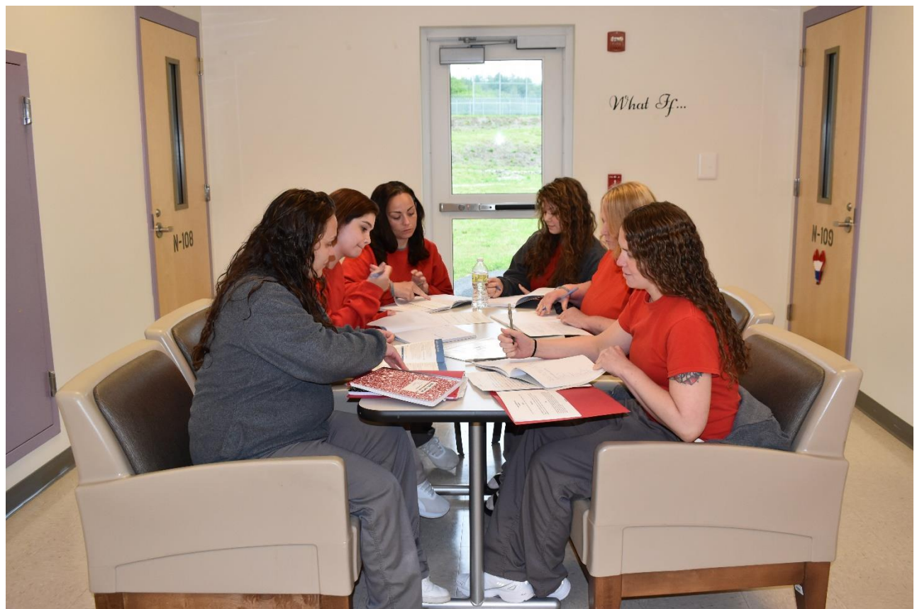
Residents of the Progressive Pathways Program working on course material in their unit.