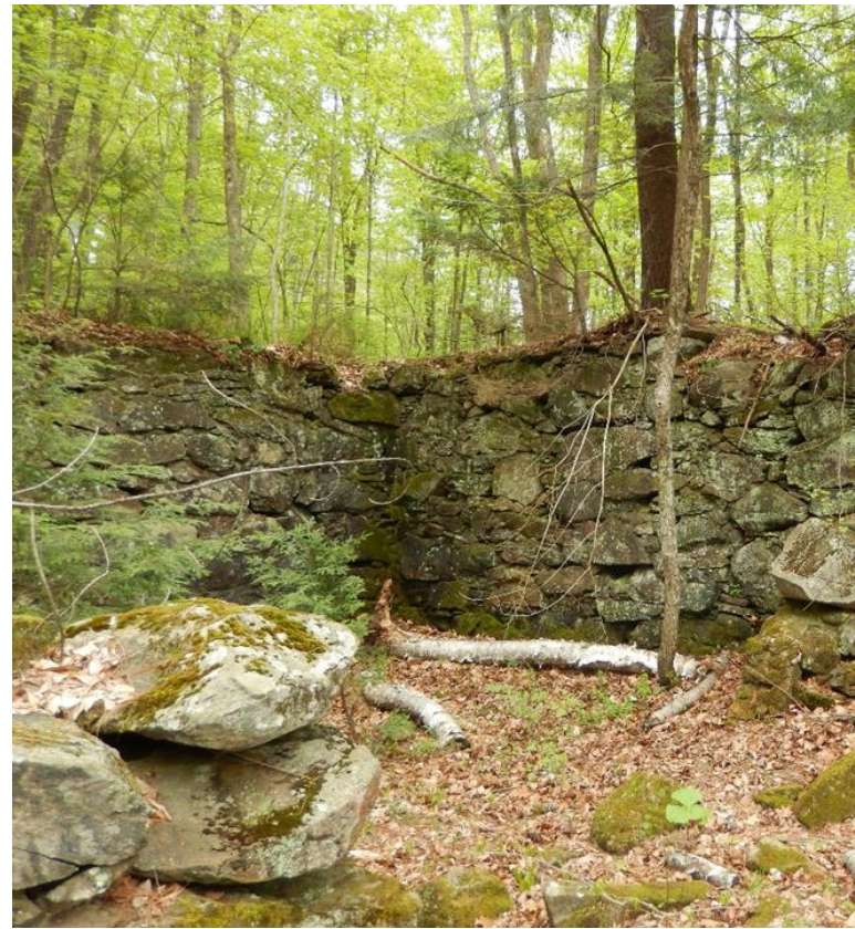
Fibreboard foundation, 2016