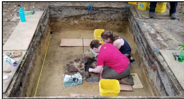
Excavation of a pre-contact Early Woodland period hearth feature at Livermore Falls State Forest, 2019

Session 2 will take place at Bear Brook State Park, along the Suncook River, in the town of Allenstown, NH. Field school participants will