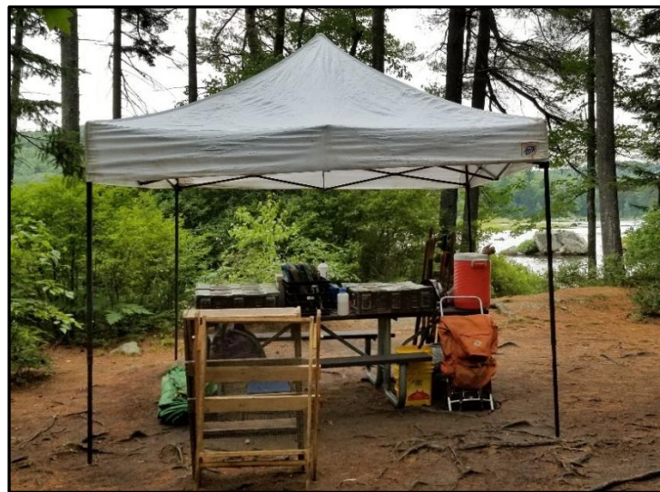
Field camp at Pillsbury State Park, 2019

engage in the survey of several areas exhibiting the potential to contain pre-contact deposits as well as continue to excavate a pre-contact archaeological deposit identified during the 2019 season. Work will focus on a terrace of the Suncook River within the park. Archaeological survey and excavation techniques including artifact identification and excavation documentation will be taught. The field camp will be based at the Bear Brook State Park campground and camping will be available at no cost to participants.