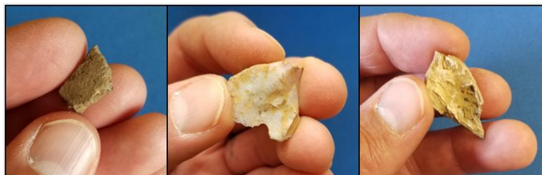
Pre-contact ceramic, lithic, and faunal artifacts excavated at Bear Brook State Park, 2019

Individuals may participate as SCRAP volunteers. There is no fee for participation as a volunteer; however we request a $40 donation to defray costs of supplies and instructional materials. Volunteers will receive the same instruction as credit students. Successful completion of the fieldwork will earn SCRAP certification for Survey and Excavation Technician status.