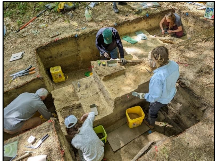
Archaeological Excavation of the South Block at Bear Brook State Park, 2022

engage in the survey of several areas exhibiting the potential to contain pre-contact Native American deposits. Work will focus on a terrace of the Suncook River within the park. Archaeological survey and excavation techniques including artifact identification and excavation documentation will be taught. Camping is available at the Bear Brook State Park campground; however, participants must make their own arrangements by visiting the state park's facility reservation website https://newhampshirestateparks.reserveamerica.com/ .