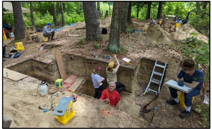
Archaeological Excavation of the North Block at Bear Brook State Park, 2022

Session 2 will take place at Bear Brook State Park, along the Suncook River, in the town of Allenstown, NH. Field school participants will