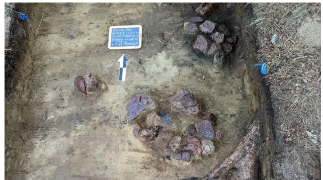
3,000-year-old Native American stone platform hearth features excavated at Bear Brook State Park, 2022

Individuals may participate as SCRAP volunteers. There is a $50 fee for participation as a volunteer to help the program defray costs of supplies and instructional materials. Volunteers will receive the same instruction as credit students. Successful completion of the fieldwork will earn SCRAP certification for Survey and Excavation Technician status.