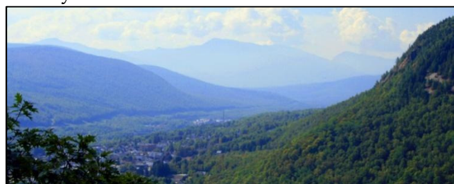
View from top of Mt. Jasper

Individuals may participate as SCRAP volunteers. There is no fee for participation as a volunteer, however we request a $40 donation to defray costs of supplies and instructional materials. Volunteers will receive the same instruction as credit students. Successful completion of the fieldwork will earn SCRAP certification for Survey and Excavation Technician status.