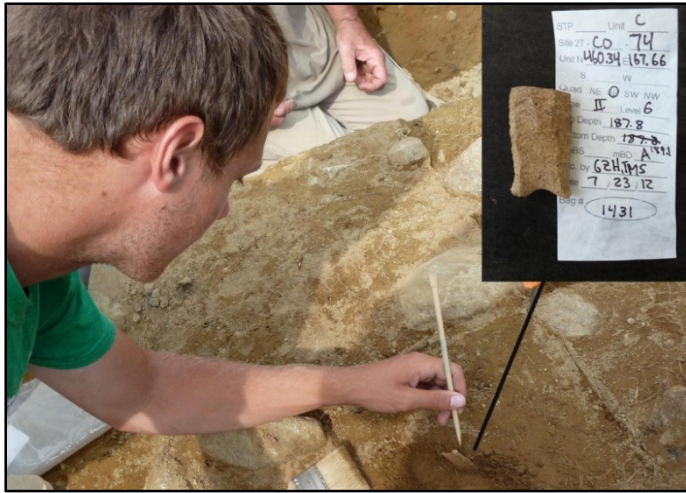
In situ recovery of a fluted point at the Jefferson VI Site.

The 2014 SCRAP summer field school in archaeology will consist of complementary investigations at Mt. Jasper, a lithic source in Berlin, NH utilized for over 12,000 years, and a Paleoindian caribou hunting and processing encampment overlooking the Israel River in Jefferson, NH.