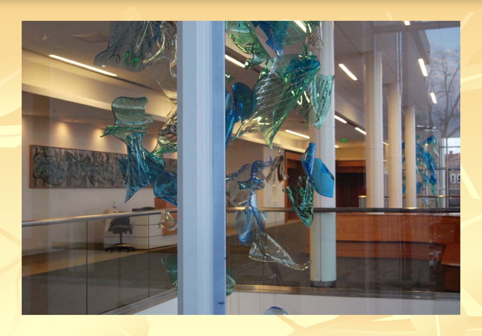
Pichler and Taylor's artwork on display