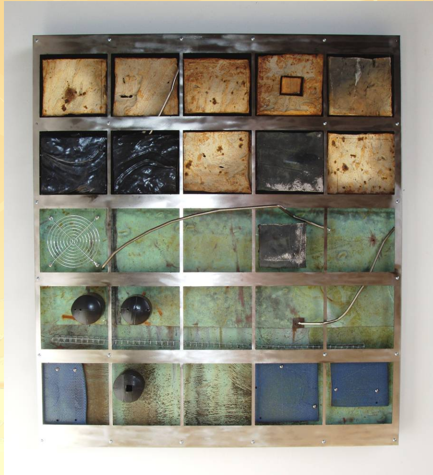
Heading West by Don Williams. Mixed media artwork in the 4 th floor conference room depicts colors of the western sky and earth.