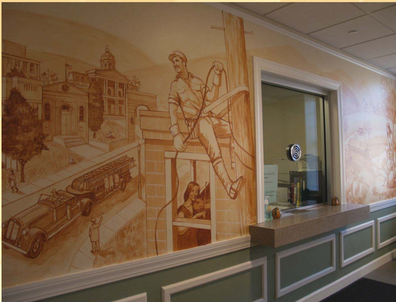
Detail of the Department of Revenue Mural