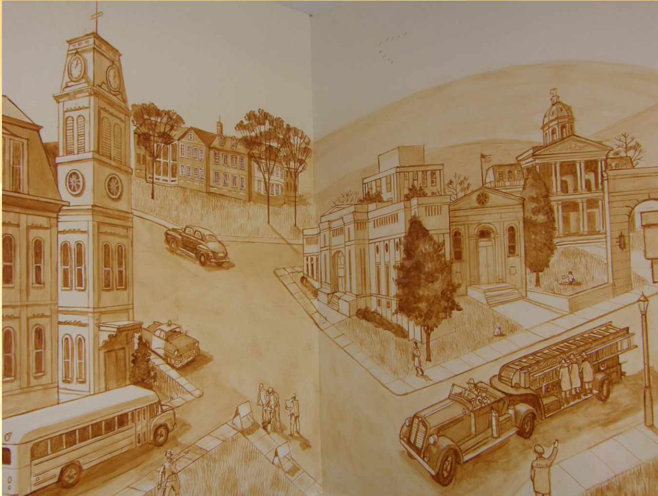
Detail of the Department of Revenue Mural