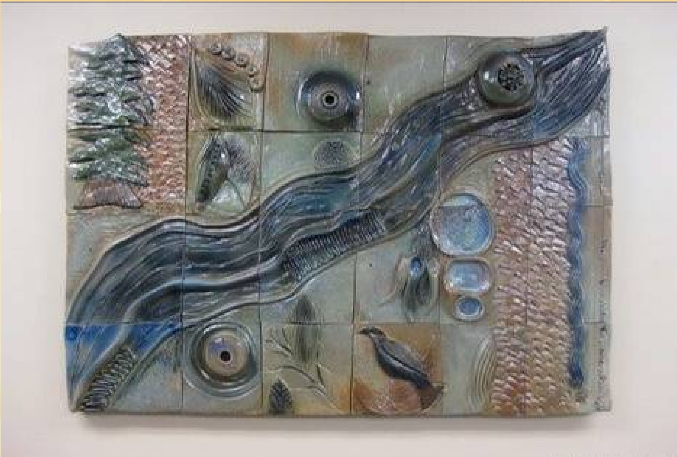
Textures and Impressions of New Hampshire by Teresa Taylor. Stoneware and ceramic glazed artwork in the 4 th floor conference room explores natural textures of flora and fauna of NH.