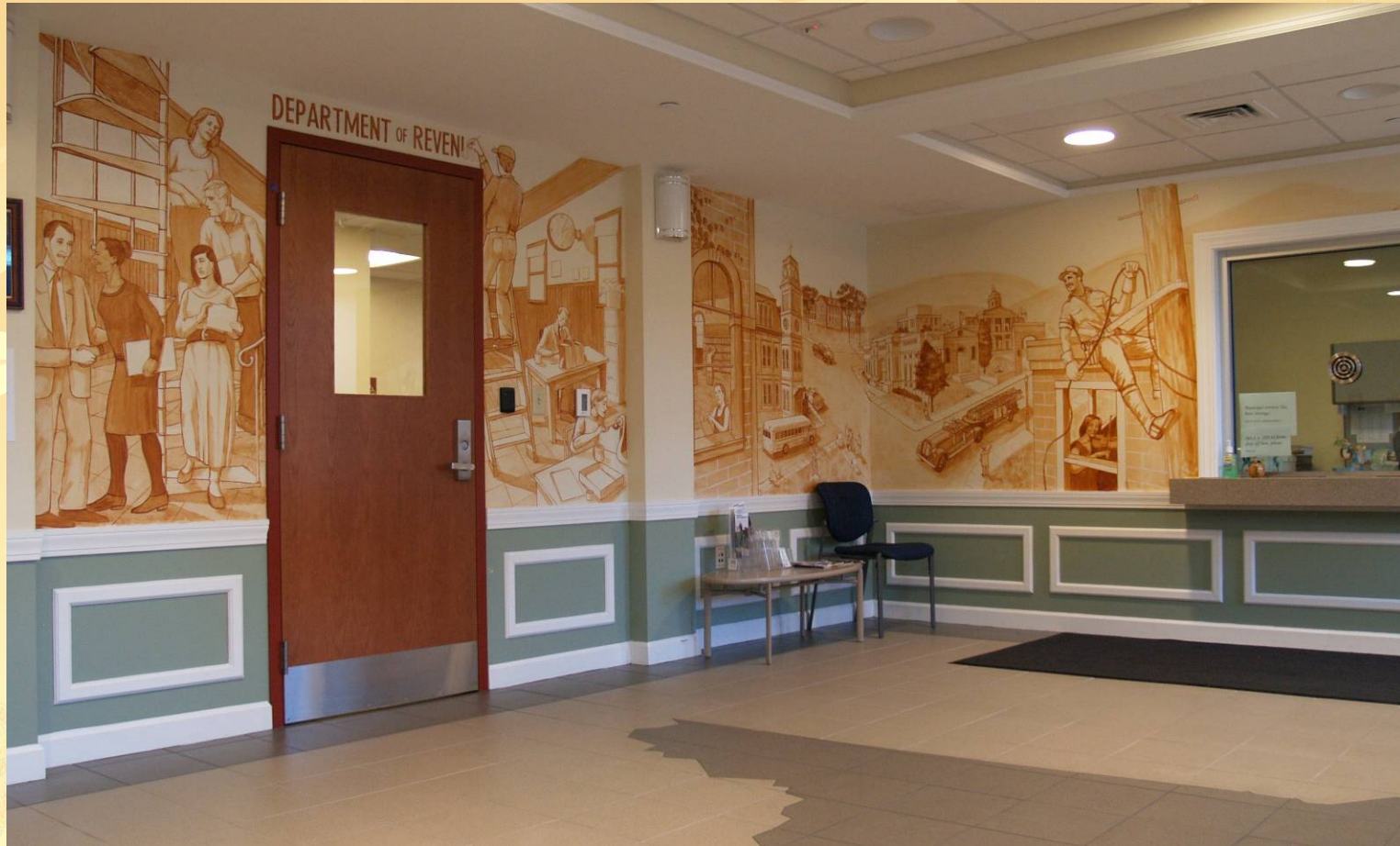
Department of Revenue Mural by Alan Pearsall. This mural illustrates the many ways in which public revenues benefit public life.