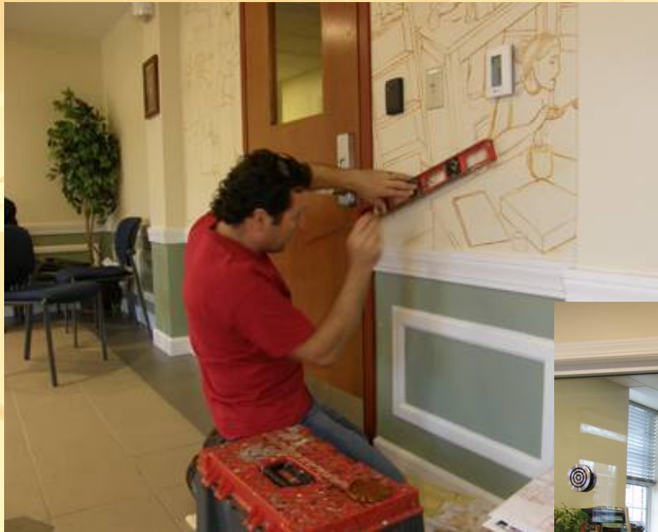
Artist Alan Pearsall