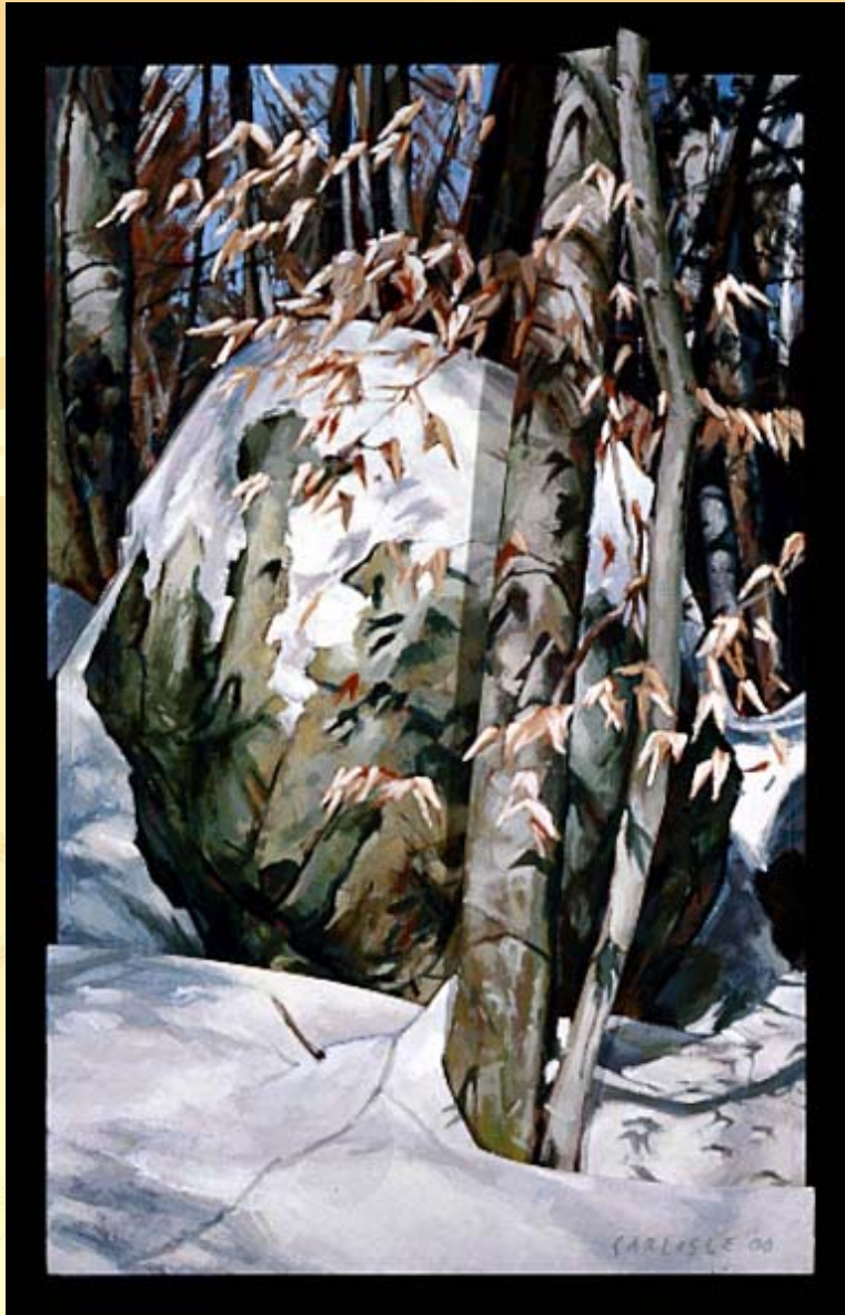
Beech Tree and Boulder by Gordon Carlisle. Acrylic on wood panel in the secondary public lobby depicts a winter scene deep in the NH woods.