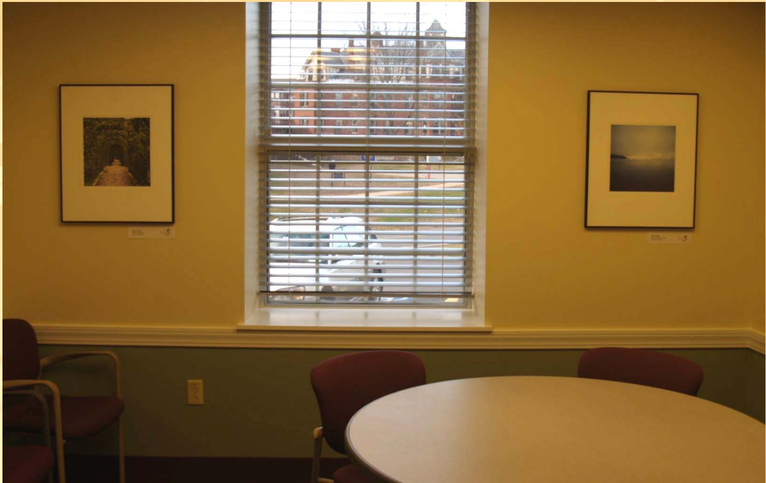
Susan Lirakis' color photographs in the small public conference room.