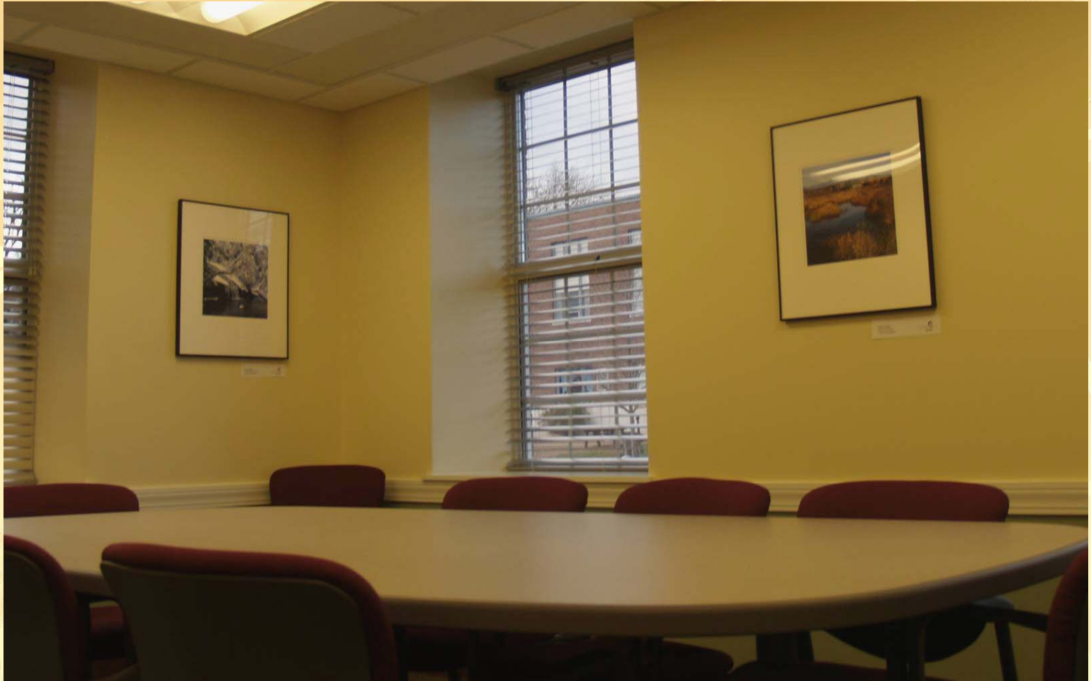
Large public conference room with Susan Lirakis' color photographs installed.