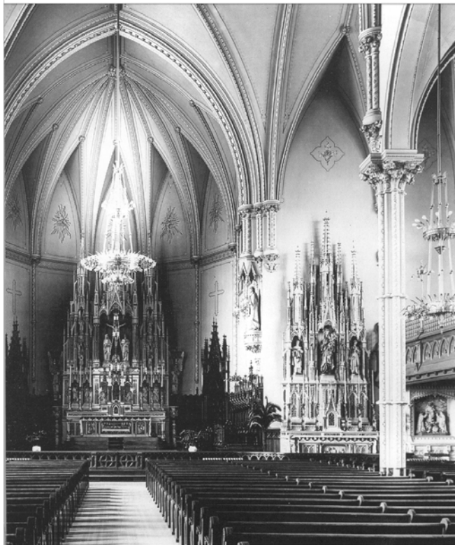
SMITHSONIAN FOLKLIFE FESTIVAL 1999

Originally published in 1999 Smithsonian Folklife Festival Program Book