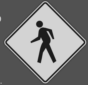
NH 28A, Manchester