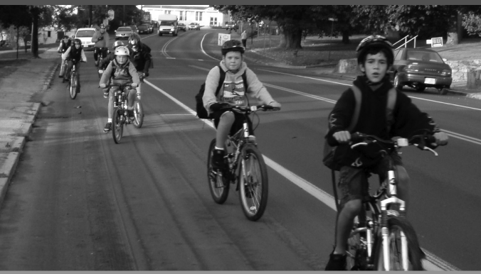
NH 116, Littleton

Bicyclists have the same rights and duties as drivers of motor vehicles. (RSA 265:143) Bicyclists must stop at stop signs and red lights, yield to pedestrians, and ride with traffic.