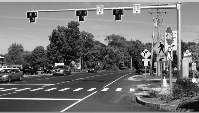
NH 125, Epping

New Hampshire law says bicyclists have the same rights and duties as drivers of motor vehicles. (RSA 265:143) Motorists must yield to bicyclists when turning, merging into bicycle lanes, and opening doors. (RSA 265:96)