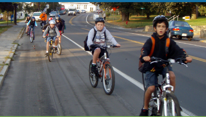
NH 116, Littleton

Bicyclists have the same rights and duties as drivers of motor vehicles. (RSA 265:143) Bicyclists must stop at stop signs and red lights, yield to pedestrians, and ride with traffic.