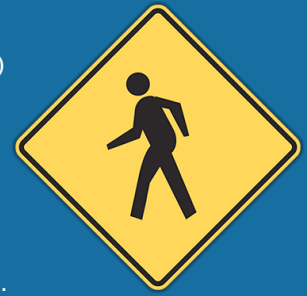
NH 28A, Manchester