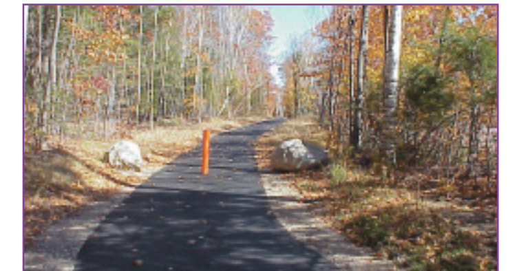
An example of a bike path built with Transportation Enhancement funds in Lincoln, New Hampshire.

Cities, towns, state agencies, private industry and special interest groups may apply for Transportation Enhancement funding for their project. Federal funds will pay up to 80% of the cost of the project, with the applicant being responsible to provide matching funds. Communities are encouraged to "Municipally Manage" their projects, allowing for local decision-making and scheduling to meet community needs.