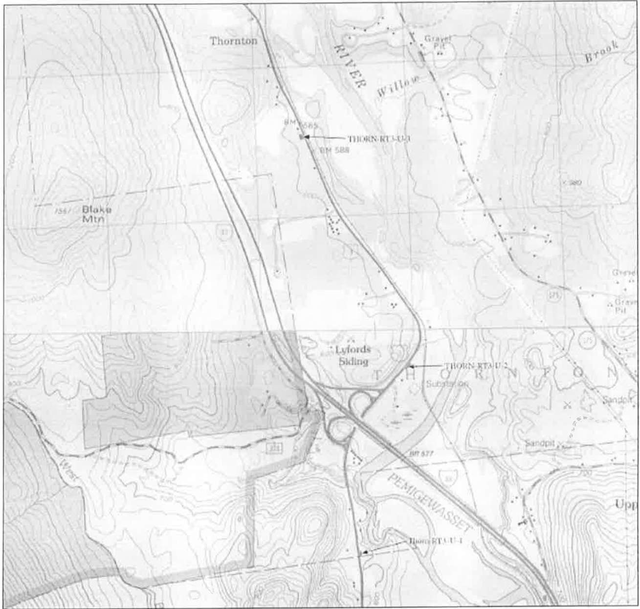
Survey Location: Route 3, Thornton