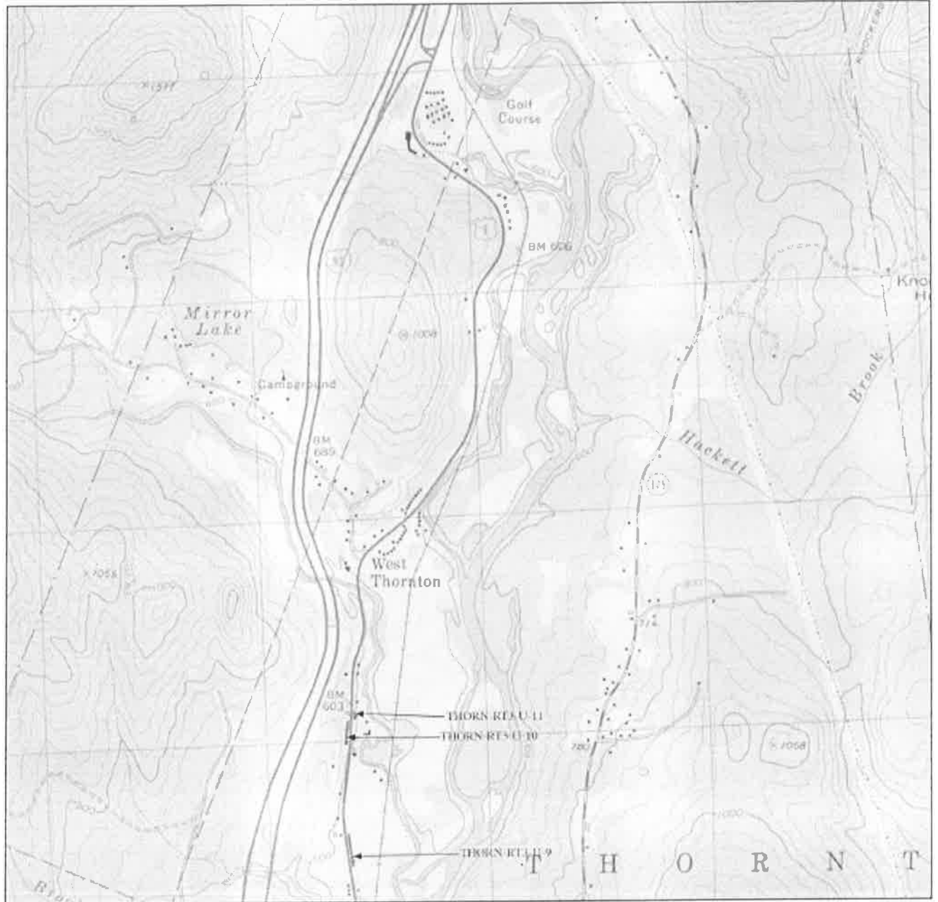
Survey Location: Route 3, Thornton