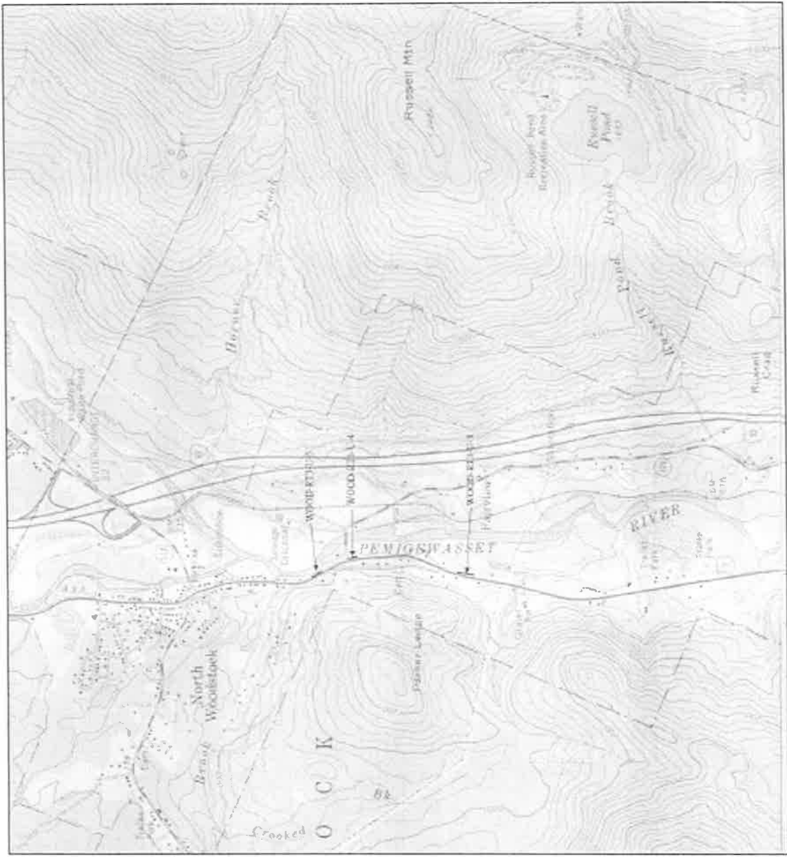
Survey Location: Route 3, Woodstock