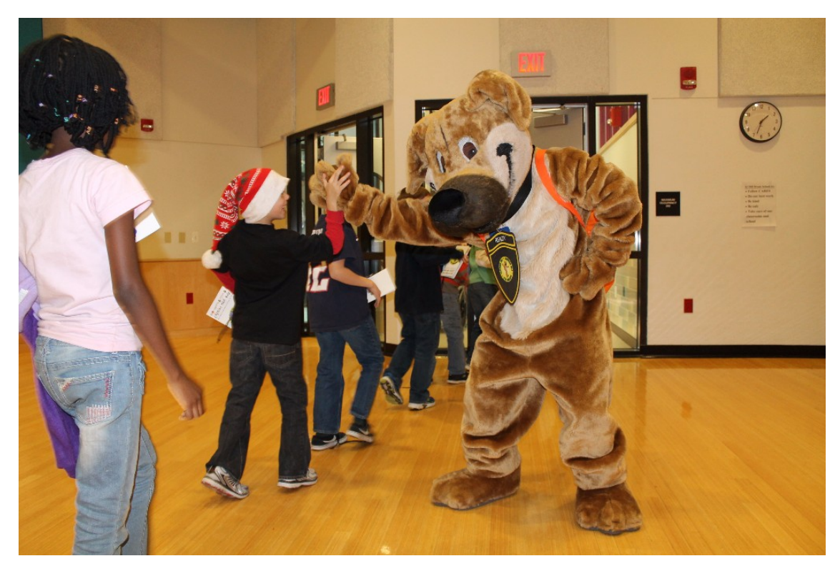
Ready, the Emergency Preparedness Chinook, gives high fives to second graders at Christa McAuliffe School in Concord. Ready visits schools and teaches students about emergency preparedness by asking them, "Are you ready?"