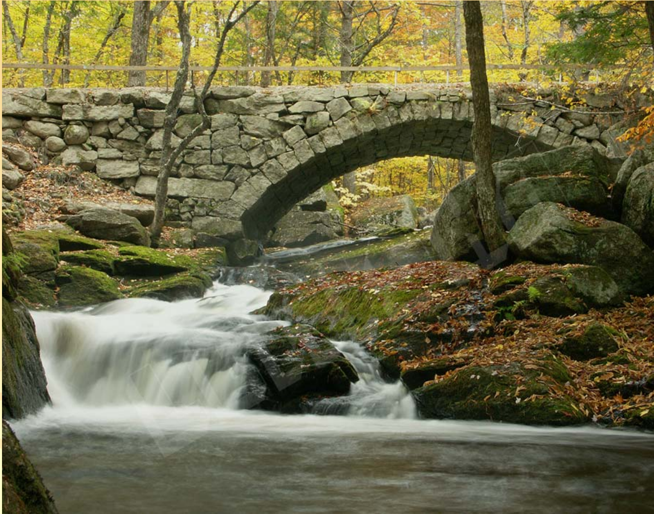
Hillsborough Stone Bridge. Color photograph of one of many historic Hillsborough stone bridges.