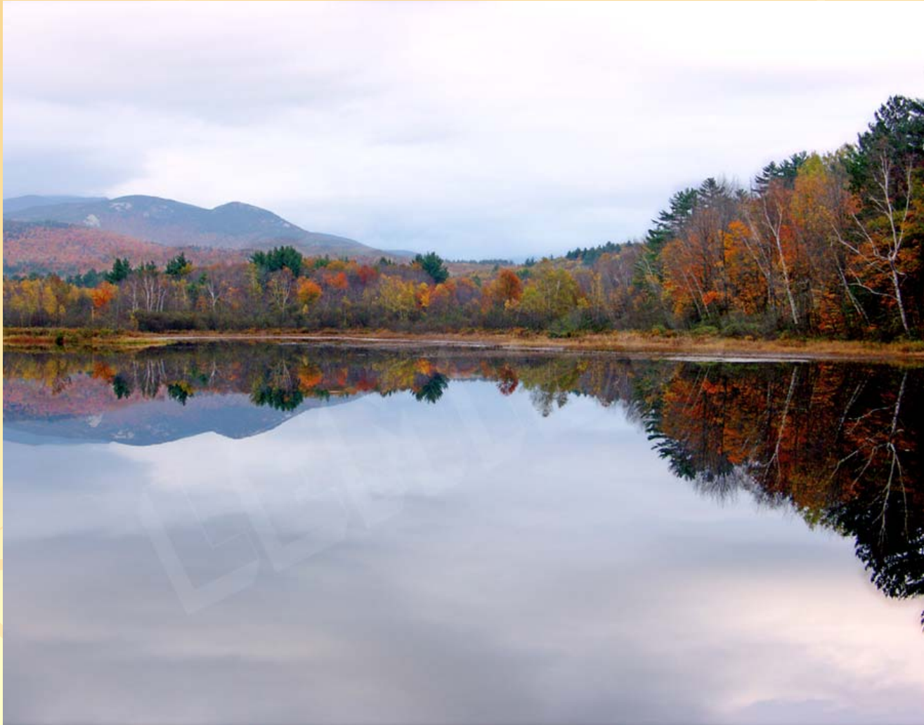
Reflections of Autumn by Peter Lemiska. Color photograph of a northern NH landscape in autumn.