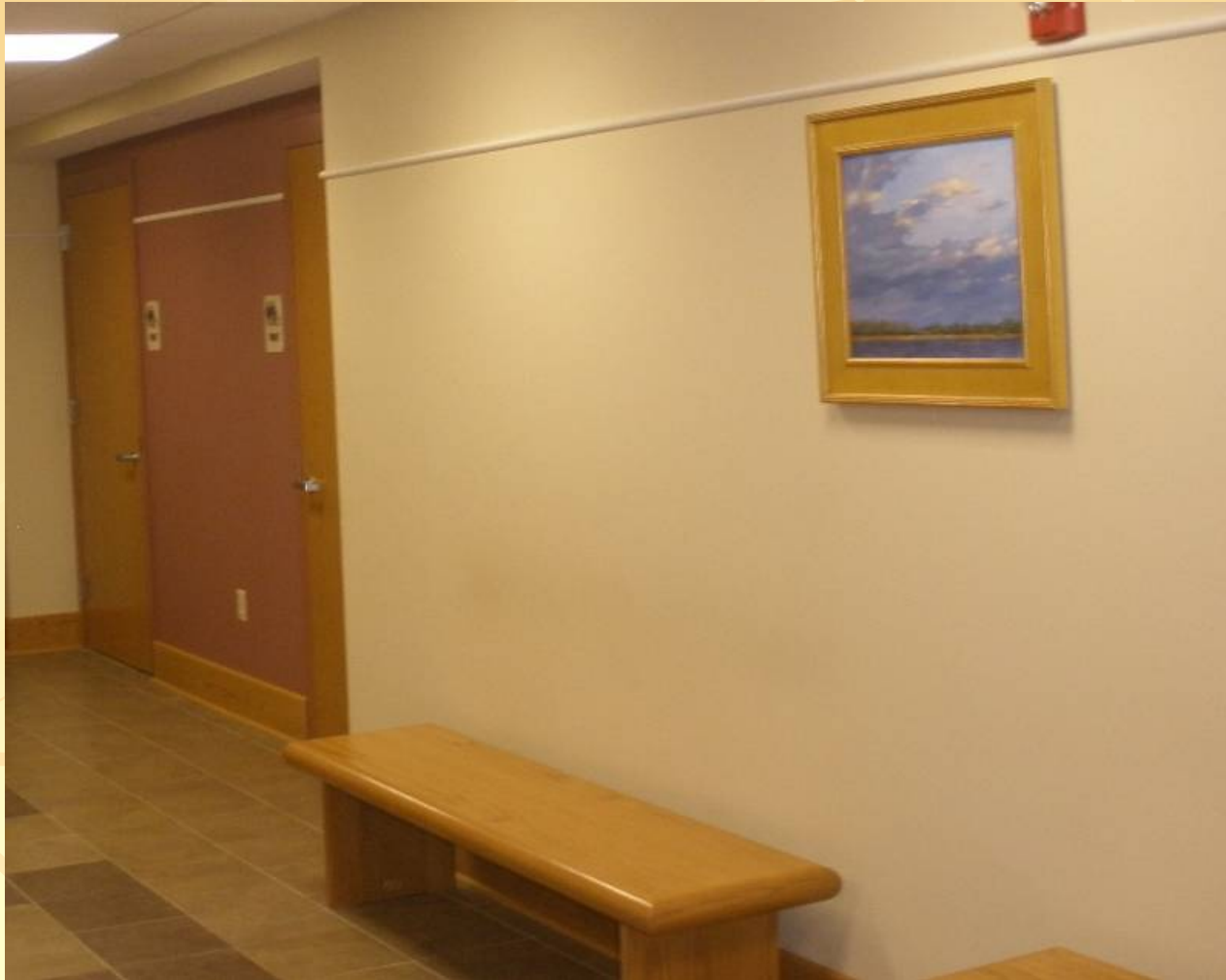
Evening Skies is located in the waiting area of the lower floor courtroom