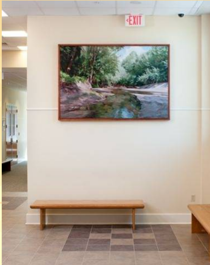
Souhegan River is located in the 2 nd floor lobby.