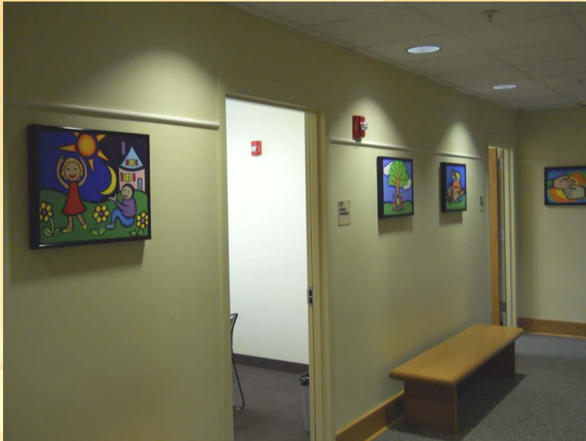
A series of four acrylic paintings by Joy Steinberg installed in the Juvenile Waiting Area