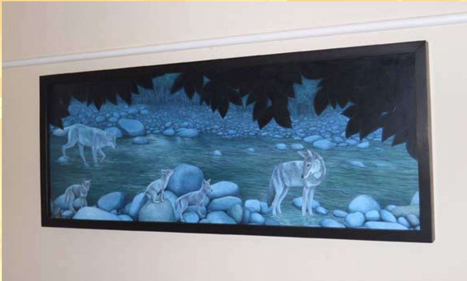
Coyotes of the Souhegan is another acrylic on masonite painting by Matt Patterson, also located in the Juvenile Waiting Area