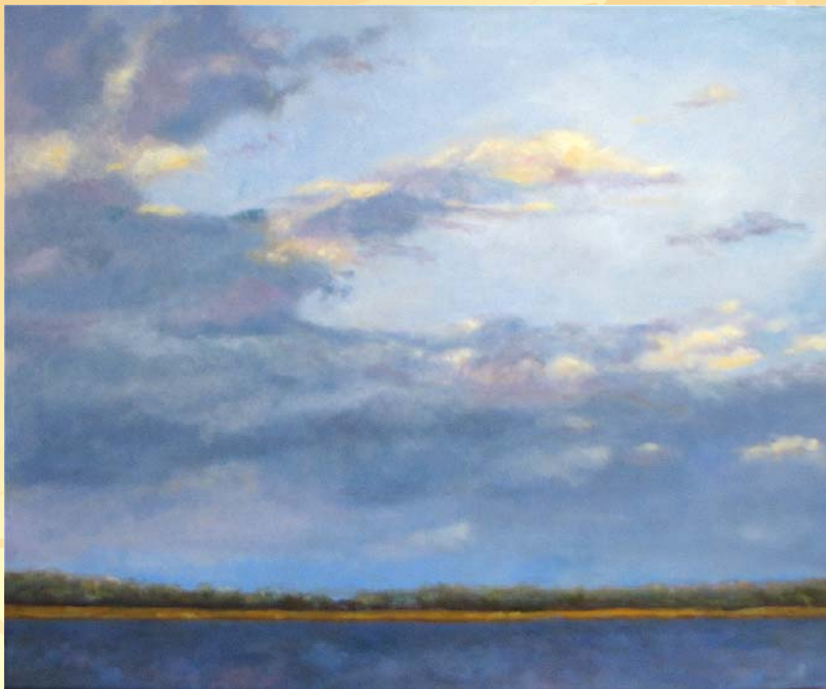
Evening Skies by Dale Partiss Greene. This oil painting reflects calm waters and stormy skies.