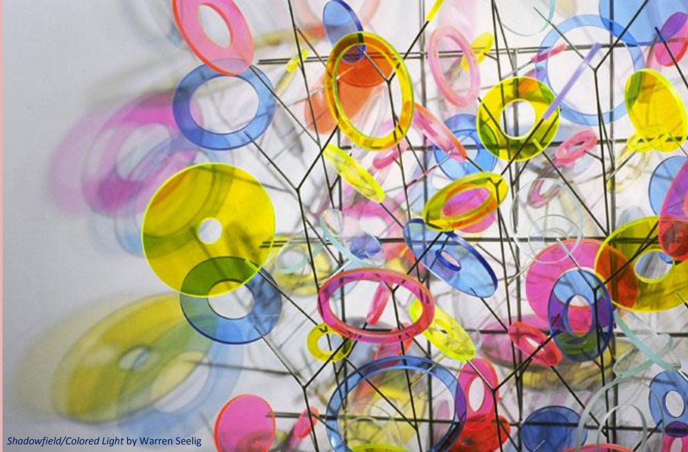
Shadowfield/Colored Light by Warren Seelig