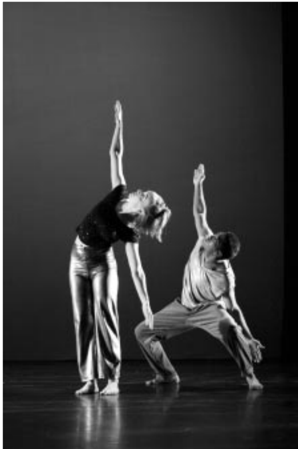
"(Another) Metal Garden" choreographed by New York choreographer Séan Curran in collaboration with the dancers was among one of the dances showcased at the Redfern Arts Center.