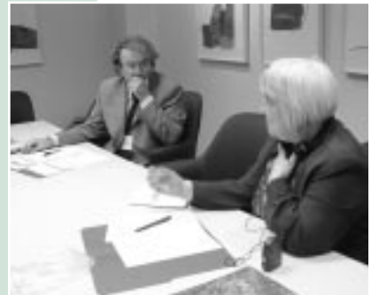
The idea of developing a cultural heritage corridor as part of the 2008 celebration for Samuel de Champlain, founder of Québec, was introduced during the formal meeting.

The sponsors of the New Hampshire delegation's visit to Québec were the Department of Cultural Resources, Public Service of New Hampshire, Jefferson Pilot Financial, American-Canadian French Cultural Exchange Commission and the New Hampshire Department of Resources & Economic Development – International Trade Resource Center.