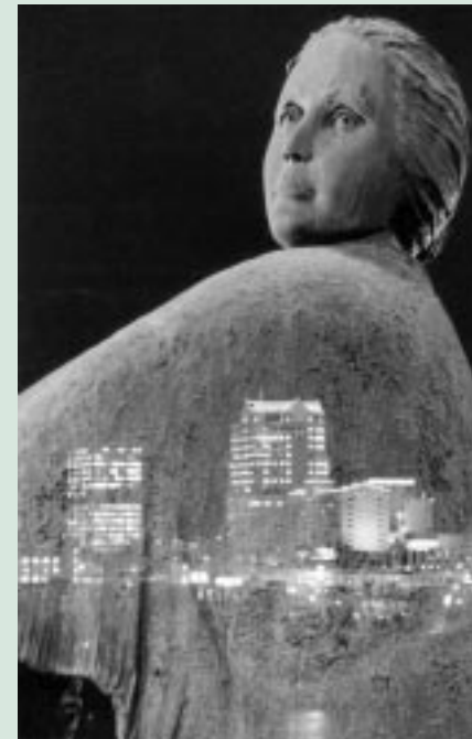
The Mill Girl statue at the Millyard Museum of Manchester, a tribute to 19th-century female textile workers, contrasts with the Queen City's modern skyline.