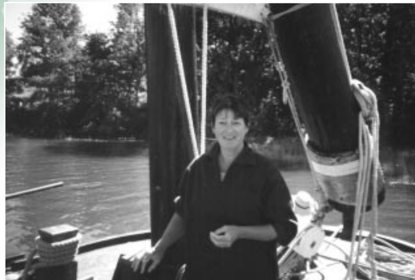
Poet Laureate Emerita Marie Harris.

Winter pushes inland up the rivers, heaving slabs of frozen sea into salt marshes: pile-ups troweled in sea colors – gray-green blue-green, black-green, gray-blue, gray-white, yellow-white, blue-white, pale white and paler to clear ice — folds and faults. Our boat is in safe harbor, anchored to the forest floor, riding snow swells. Cold noise thrums in the coiled rigging, suggests speed over the frozen ground.