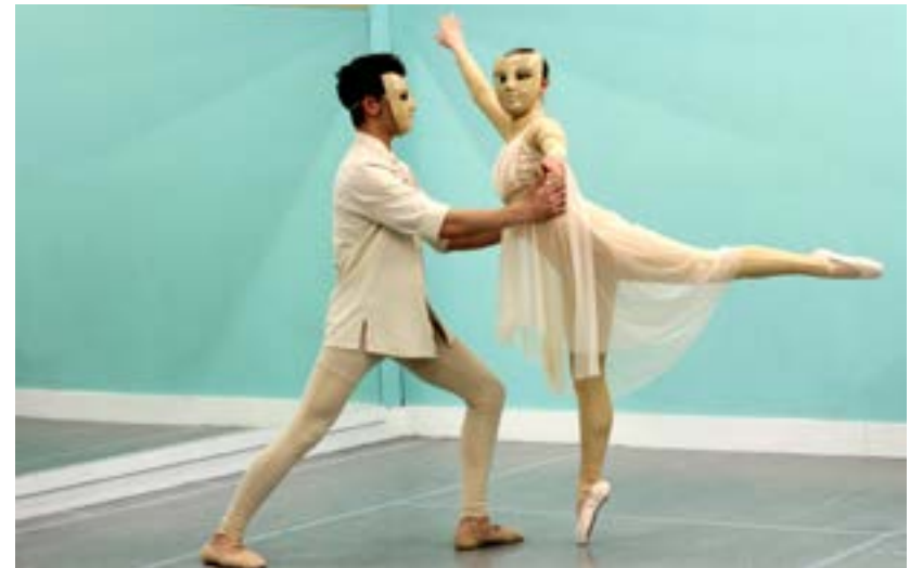
below: Center for the Arts Lake Sunapee, Pas de Deux (FY22 Arts for Community Engagement grant)