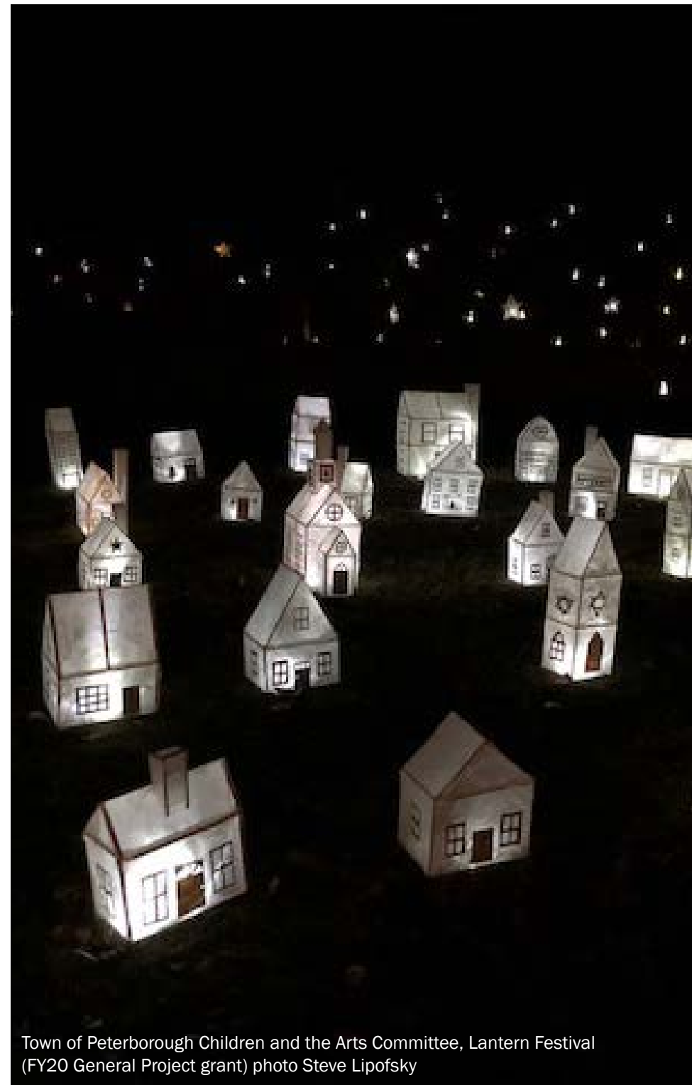
Town of Peterborough Children and the Arts Committee, Lantern Festival (FY20 General Project grant)