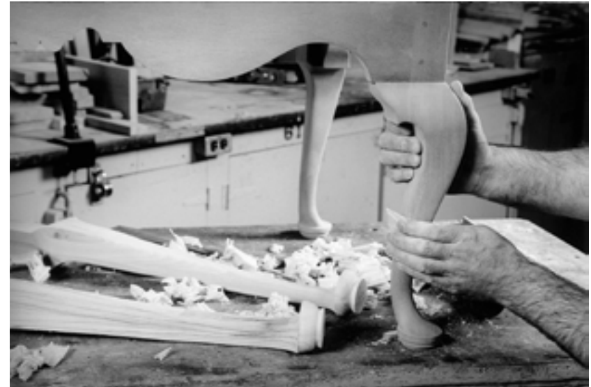
above: Furniture Masters Prison Outreach Program

We work to create a culture where everyone can express themselves.