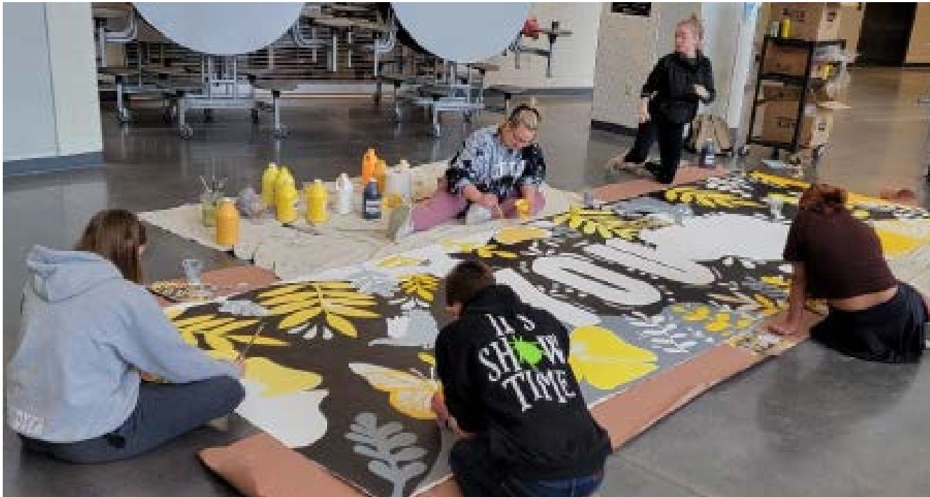
Dover Teen Center, Youth Mental Health Alliance Mural (FY22 Arts in Health grant)