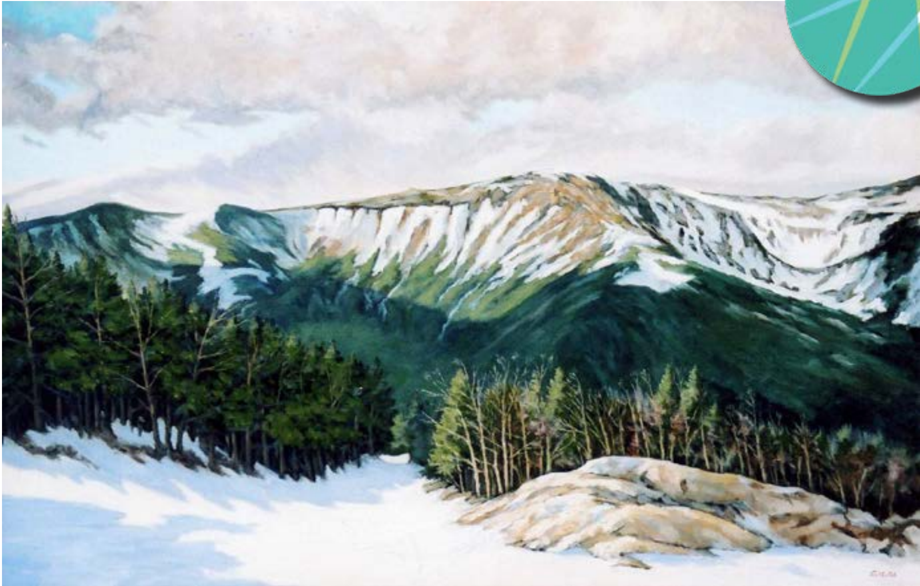
"Mount Washington" by Robert Giggi, NHSCA Arts Bank Collection